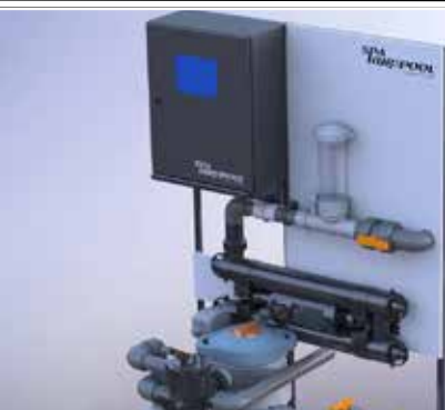
3D Modelling available

With features such as remote monitoring and CCTV you can easily keep a watchful eye over the running of your plant room. Spa hub can integrate with other equipment such as chemical auto dosers so you can easily see at a glance whether the sanitiser levels are safe, offering complete peace of mind. The system can also log events such as water level changes as well as logging error codes, faults and of course key parameters such as temperature and chemical levels.