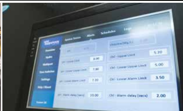
Easy to use touch screen controls